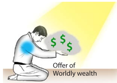
Offer of Worldly wealth