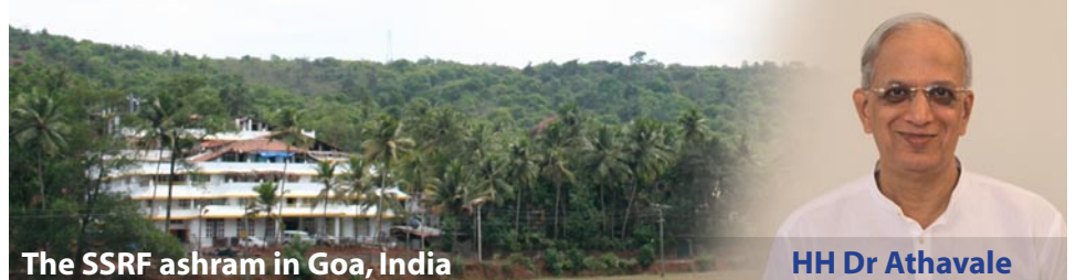
The SSRF ashram in Goa, India